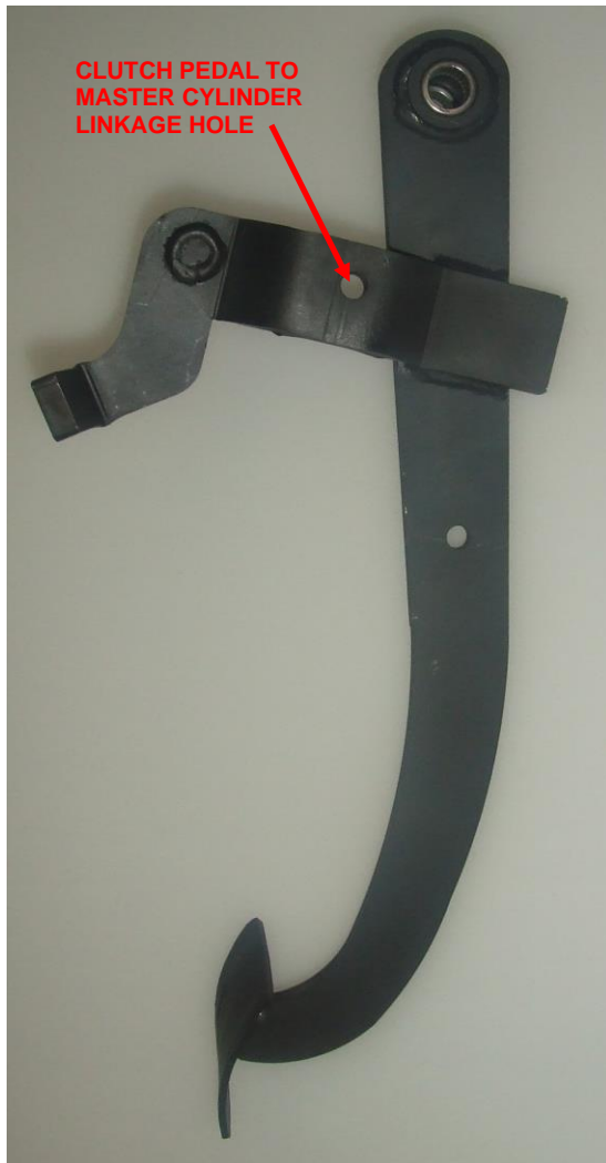
1966-70 B-Body Clutch Pedal