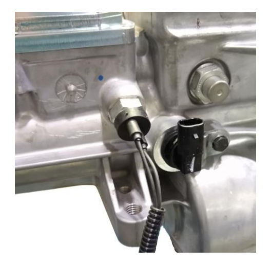
MECHANICAL SPEEDOMETER PORT